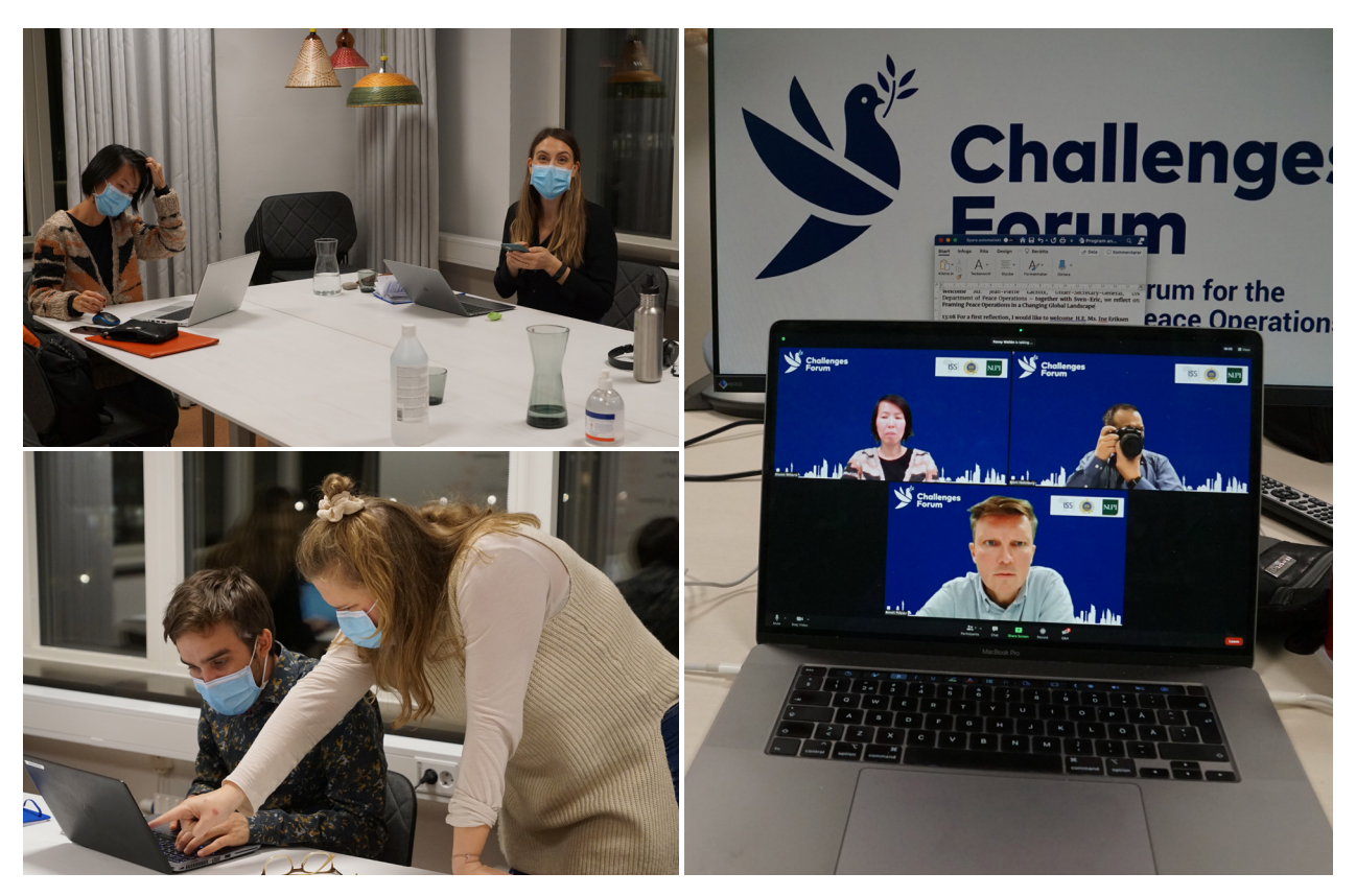
The CFIS team, dedicated to lead the virtual event from the Stockholm office.

gaps and cultural differences between the two organisations. Some participants recommended that the President of the UNSC and Chairperson of the AU PSC should have informal meetings at the start their terms to harmonize their agenda and develop the relationship further.